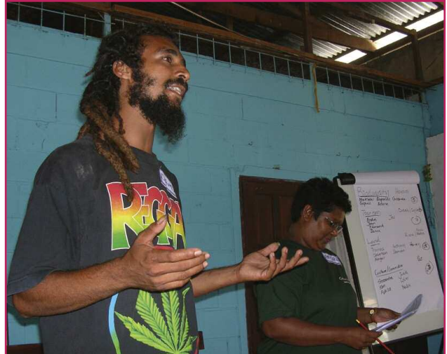
People in communities surrounding the Aripo Savannas were given the opportunity to express their ideas and needs as part of the management planning.

This presents a number of challenges even in a context such as the development of the Jamaica LFMCs where broad community engagement has been enshrined in the project design from the outset (see Box 5). These can be compounded by the fact that the support agencies may be sceptical of, or lack the requisite skills to conduct, such participatory processes. However, while effective community engagement of this kind will generally be a lengthy and iterative process, the livelihood and conservation benefits can be significant, including the fostering of relationships that improve the sustainability of the desired outcomes (see Box 6).