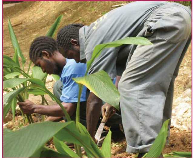
Members of the Fondes Amandes Community Reforestation Project planting in the Fondes Amandes watershed in north Trinidad.

Community participation in natural resource management cannot be effective without an enabling policy environment, not just in areas with obvious linkages such as land use planning, land tenure, agriculture, forestry and fisheries but also in terms of those relating to finance and economic development, social development, community development, civil society capacity building, and heritage