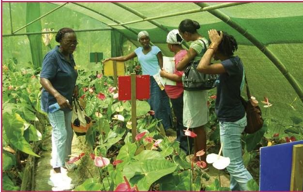
Clozier Youth Farmers of Grenada are producing anthuriums for the hotel industry and building their capacity in nursery management and marketing.