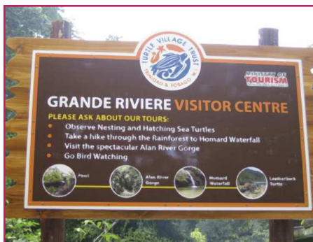
Turtle Village Trust partners with local communities in Grande Riviere and other "turtle villages" in N.E. Trinidad and S.W. Tobago.