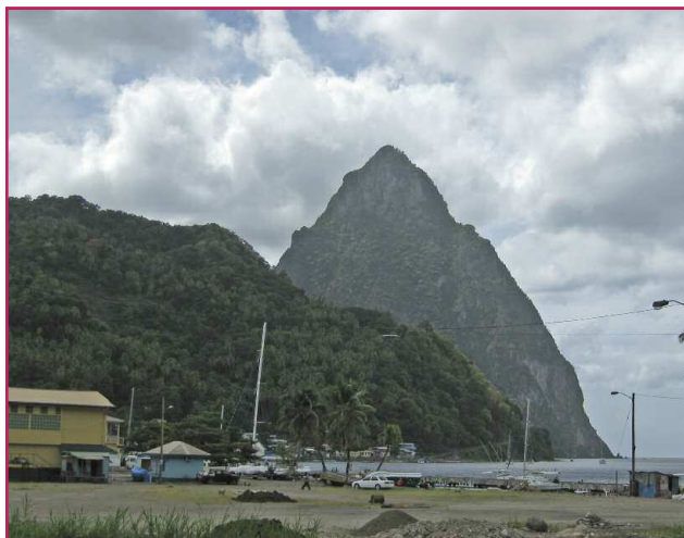
The breakdown of the institutional arrangement for community-based management of Gros Piton tours has enabled a private entrepreneur to take over and reduced the community’s involvement in decision-making and benefit-sharing.

For the purposes of this brief, a financially sustainable CBO is considered to be one that sustains itself through a diversified fundraising strategy (i.e. not over-dependent on a single source but that may include grant funding), which