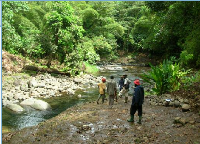
Rivers in Saint Lucia provide water for domestic use and for the agriculture industry.