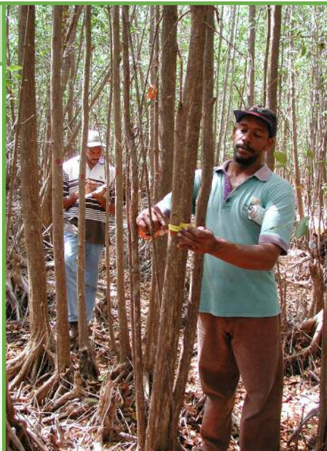
Mangrove forest can serve as coastal defences against intense storm surges.