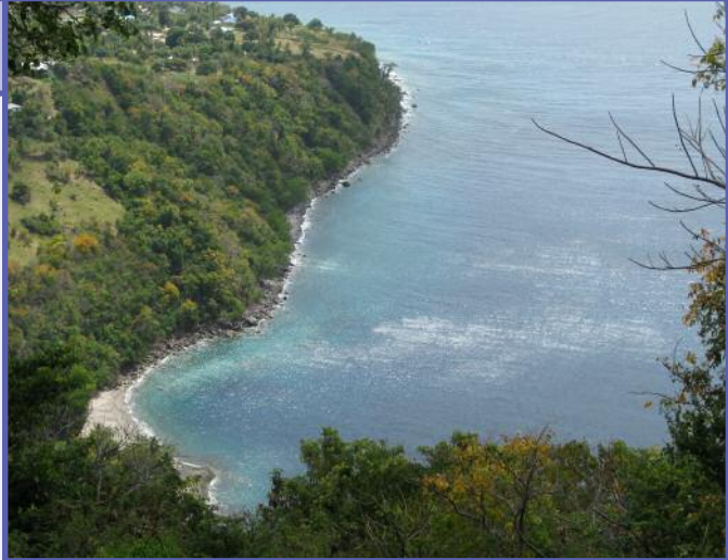
A view of Fonds Gens Libre from the Piton reminds us of the importance of coastal resources in the history of slavery in the Caribbean.