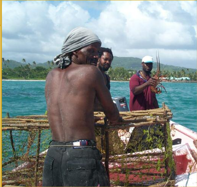
Climate change can negatively impact the size and availability of catch for fishers.