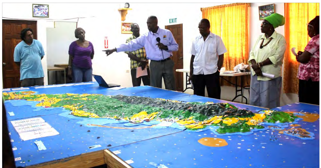
Workshop participants discuss Tobago's vulnerability to climate change

The priority areas are detailed below, along with potential solutions.