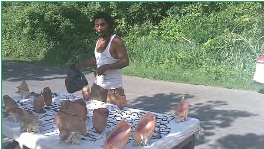
Many persons in Tobago depend on natural resources to earn their incomes