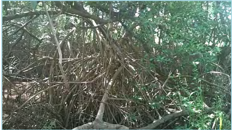
Mangroves are important to protect Tobago's coastline