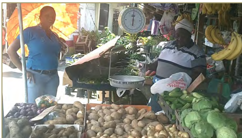
Growing food crops is important to food security in Tobago.