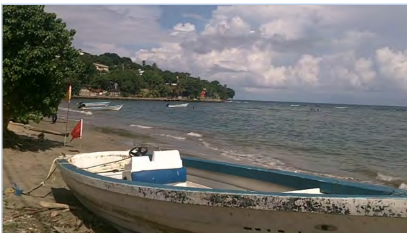
Research is important to help make the right decisions to adapt to climate change