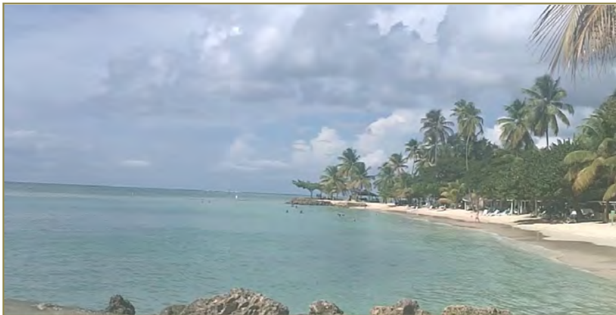
Without coral reefs, the white sandy beaches will be lost.