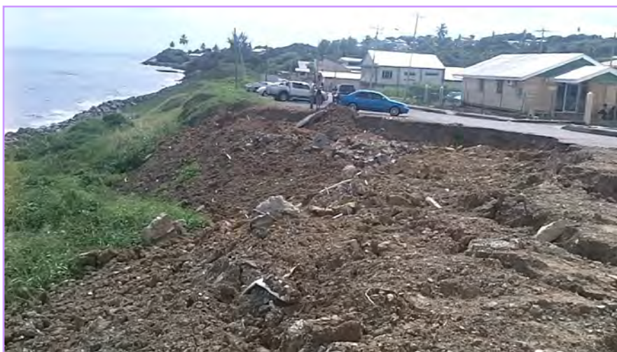
Coastal erosion is already occurring in Tobago and will worsen as the effects of climate change become more apparent.