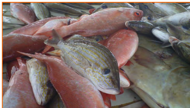
Fish is an essential part of Tobago's food security.