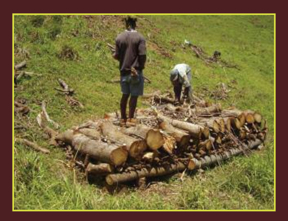
Charcoal pit construction