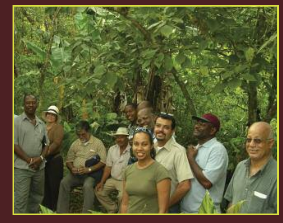
Welcome shade during a forest hike

Users of the forest who recognise this co-managing role are usually the ones who reap the greatest benefits... in their livelihoods, in their communities, in their lives.