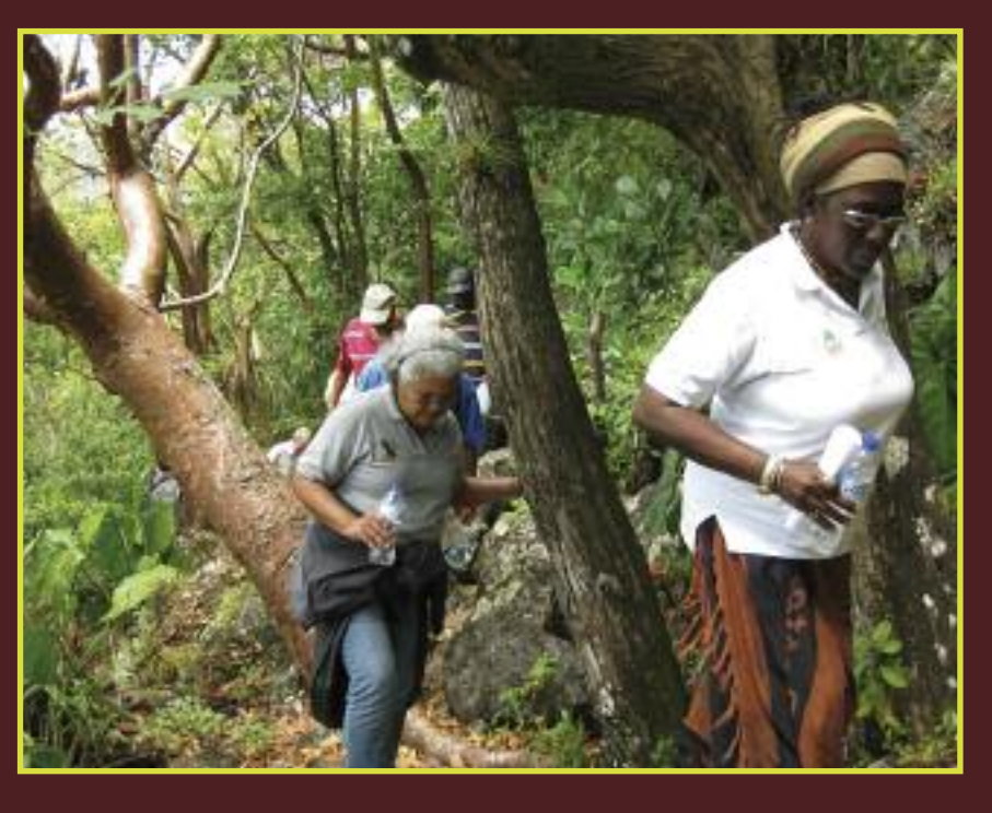
Forest tour activities