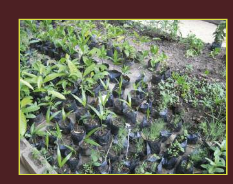
Forest seedlings in nursery

When these people help the forest to continue producing its goods and services, continue with their use of the forest.