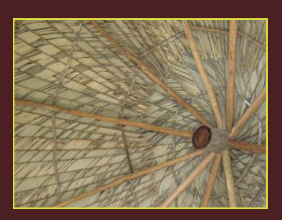
Thatched roofing from the forest