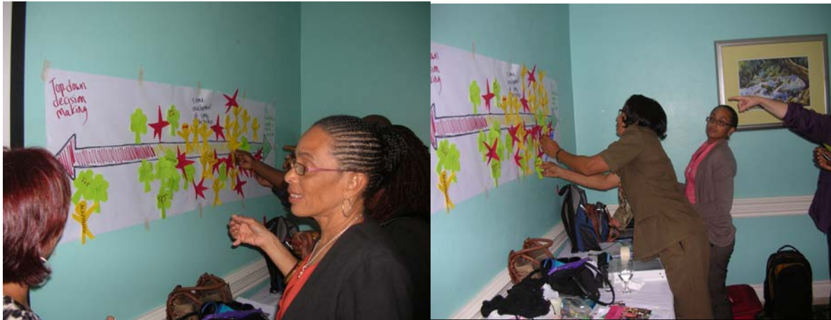
Photo 1 and 2 Participants allocating stars on the spectrum of participation.

The levels of participation in decision-making practiced by participants, their organisation and forest management in their country are shown in Photos 1 to 3, where labelled stars indicate the position on the spectrum (based on the spectrum in the draft toolkit from Borrini-Feyerabend, 1996 4 ).