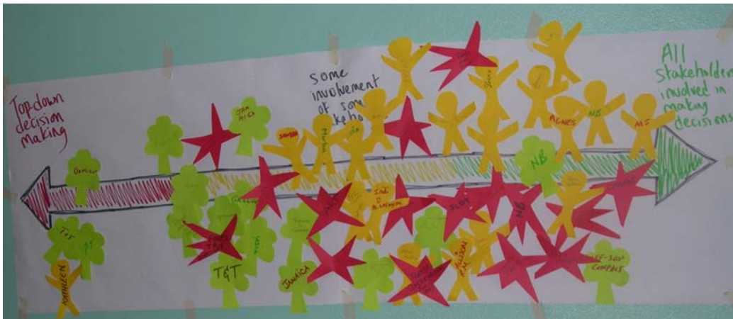
Photo 3 Completed spectrum depicting levels of participation practiced by participants