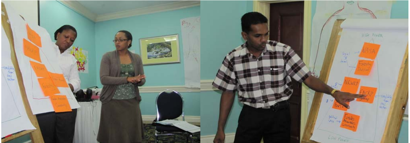
Photos 7 and 8 Participants presenting their analysis of power relations

The maps of relationships among stakeholders identified in the FACRP case study were depicted in simple diagrams. Key points noted were: