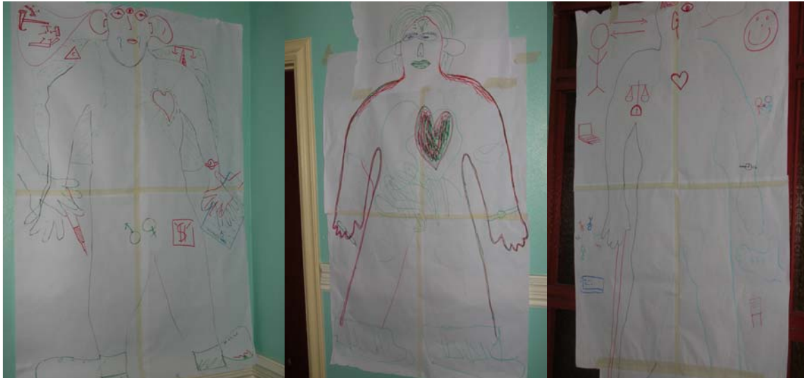
Photo 4, 5 and 6 Completed body maps depicting the capacities needed by a facilitator.

Participants noted that planning is a key element of effective facilitation and highlighted that several aspects of planning are important. Issues discussed are documented under each aspect.