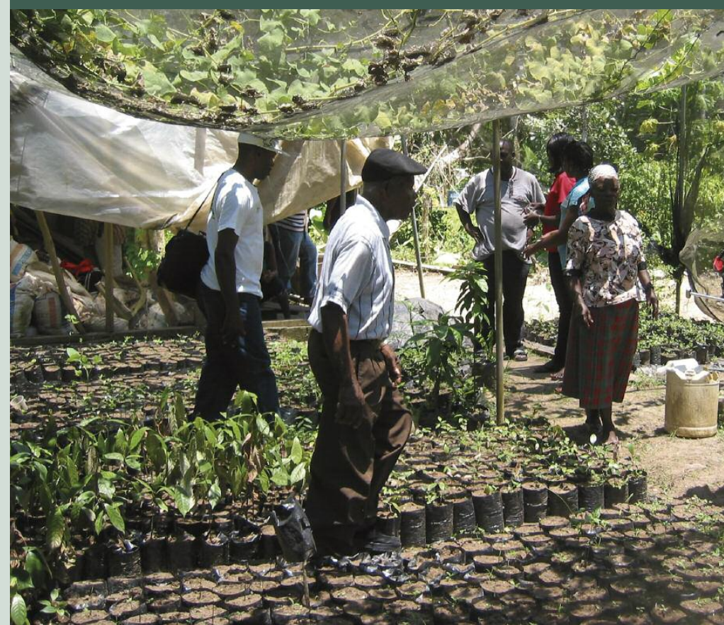
Pencar Local Forest Management Committee in Jamaica