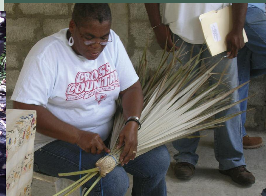
Superior Broom Producers in Saint Lucia