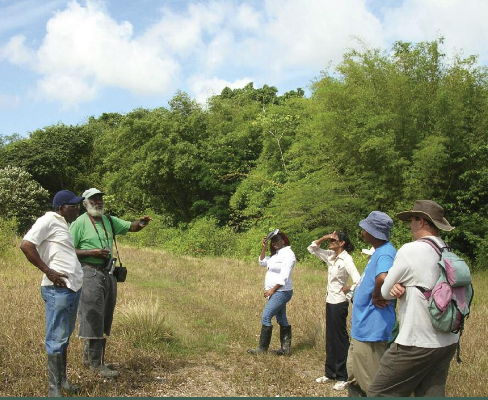
Sundew Tourguiding Services

In many rural communities living near to forests in the Caribbean islands, people have formed community-based organisations (CBOs) and are working in partnership with the government and other stakeholders to help to better manage forests and ensure that they are used sustainably.