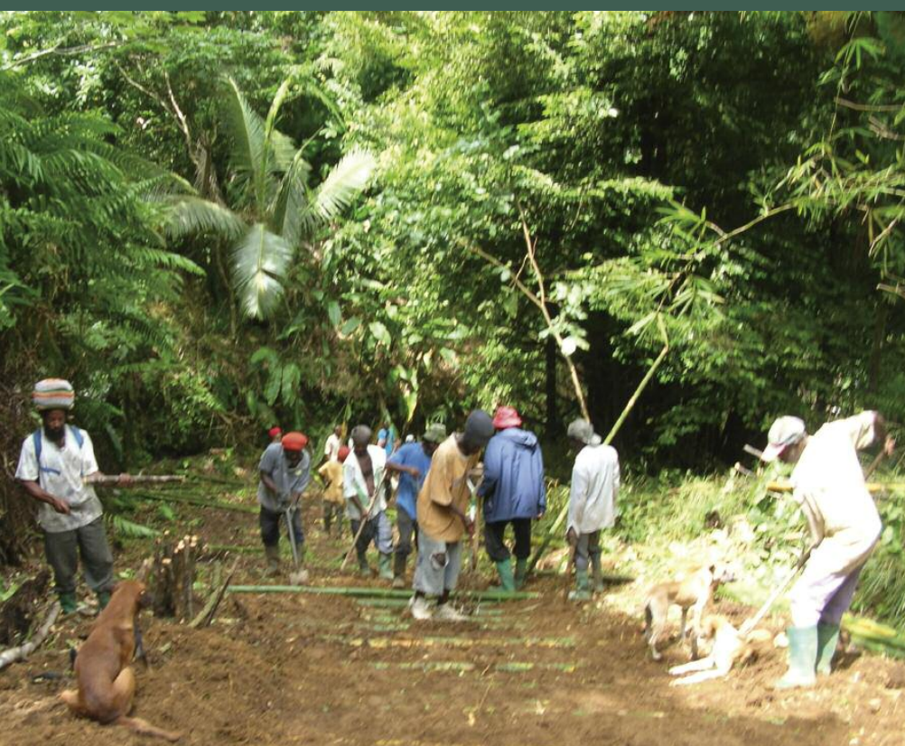
Partners of the Environment in St. Vincent

Rural communities in the Caribbean are participating in.... sustainable extraction of forest goods