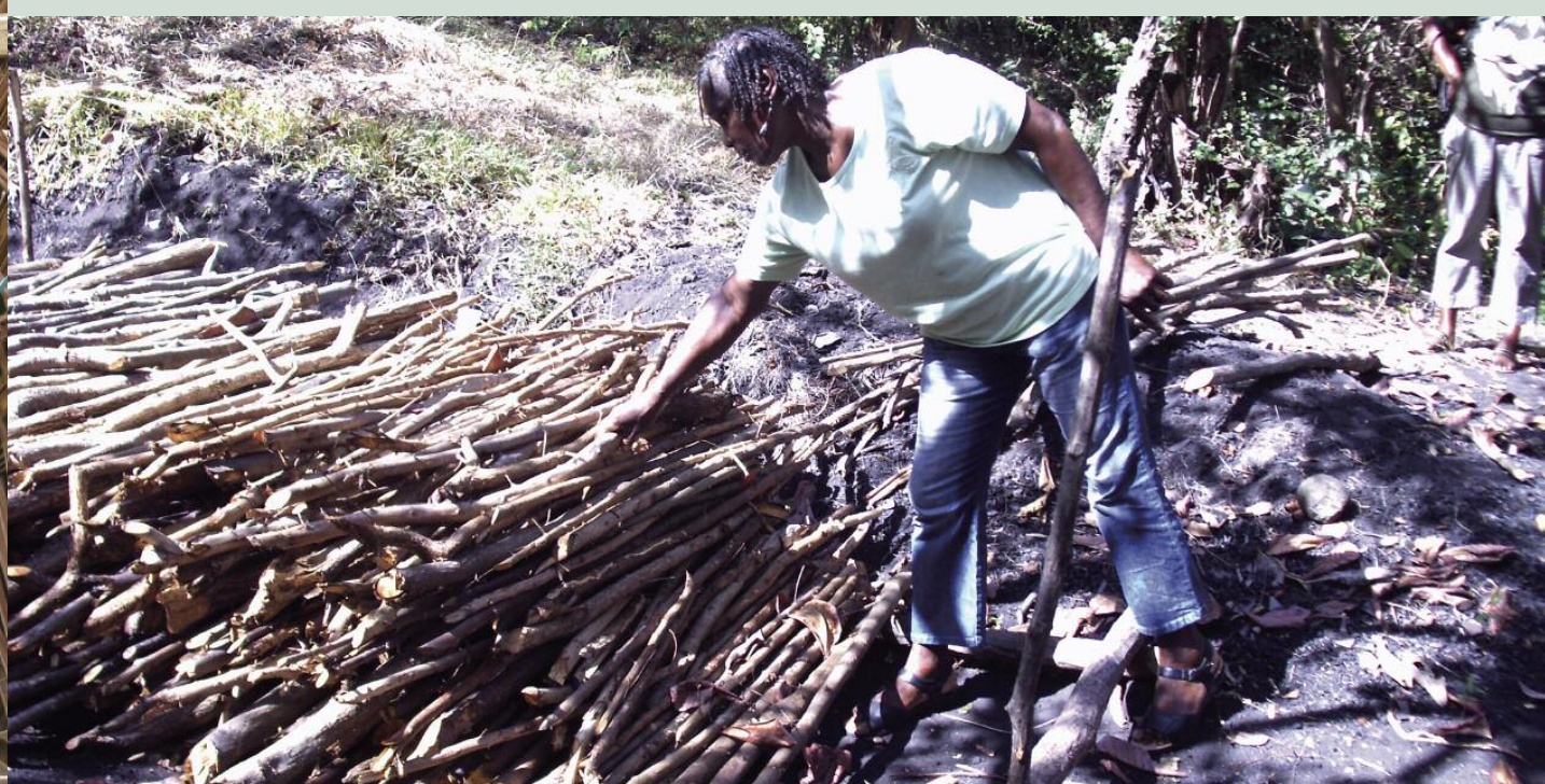
Aupicon Charcoal Agricultural Producers Group in St. Lucia