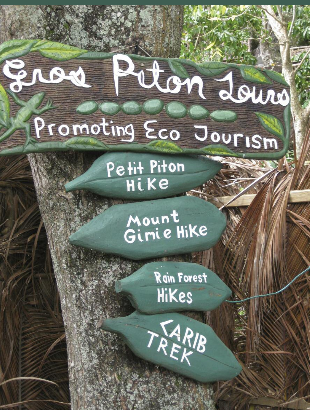
Gros Piton Tours