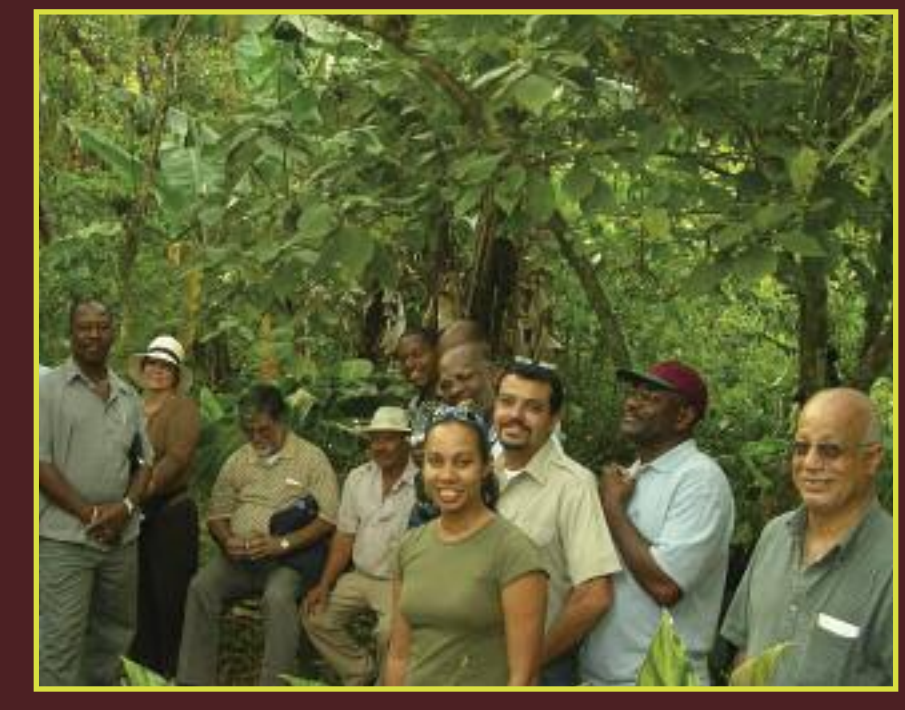
Welcome shade during a forest hike

Users of the forest who recognise this co-managing role are usually the ones who reap the greatest benefits... in their livelihoods, in their communities, in their lives.