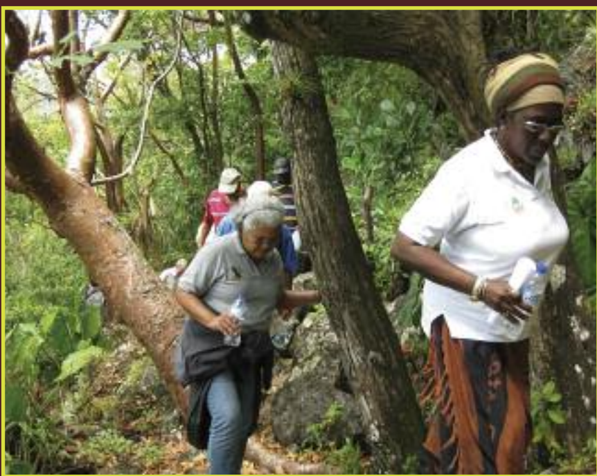
Forest tour activities