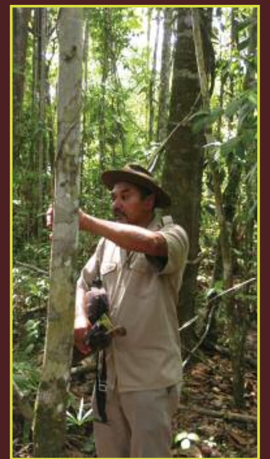
Forestry officer - a forest co-manager

Sustaining this harmonious life of quality, therefore generates livelihood surety.