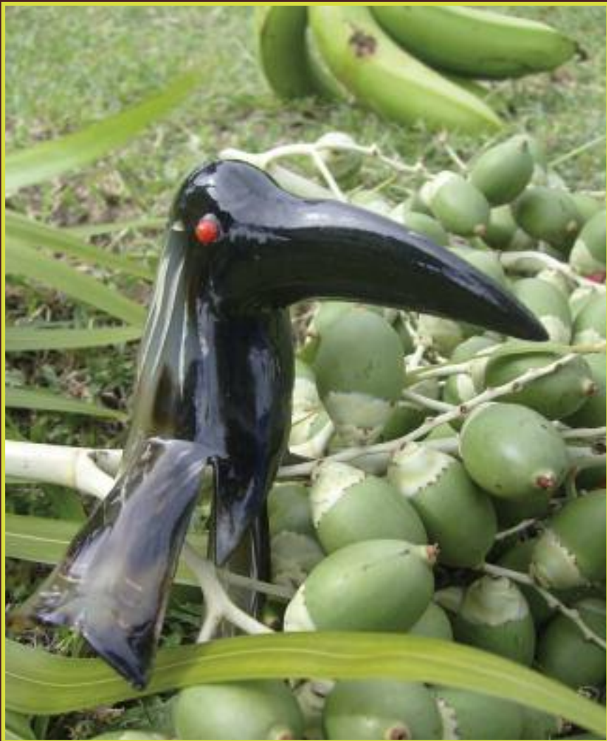
Craft items produced from the forest