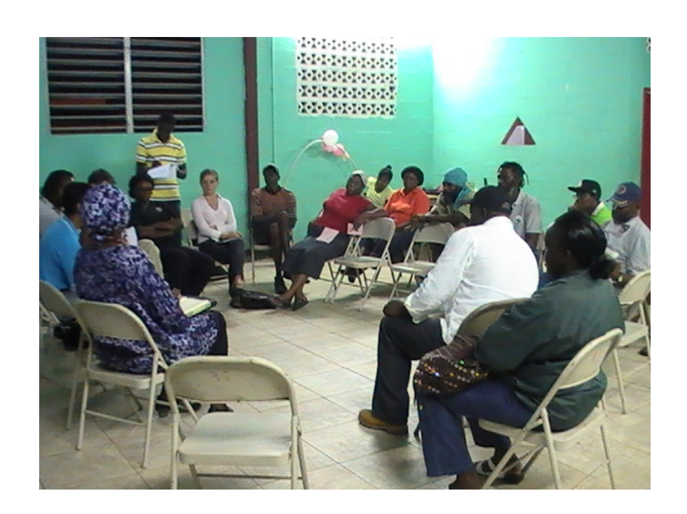
November 23, 2010 Speyside Community Centre Speyside, Tobago